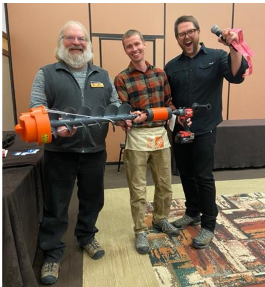
Pictured to the left: An ice auger-drill combo was the top raffle prize at the 2023 WIAFS Annual Meeting