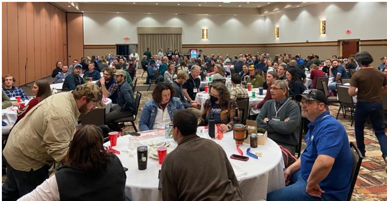
Pictured above: WIAFS Annual Meeting Grand Social and raffle