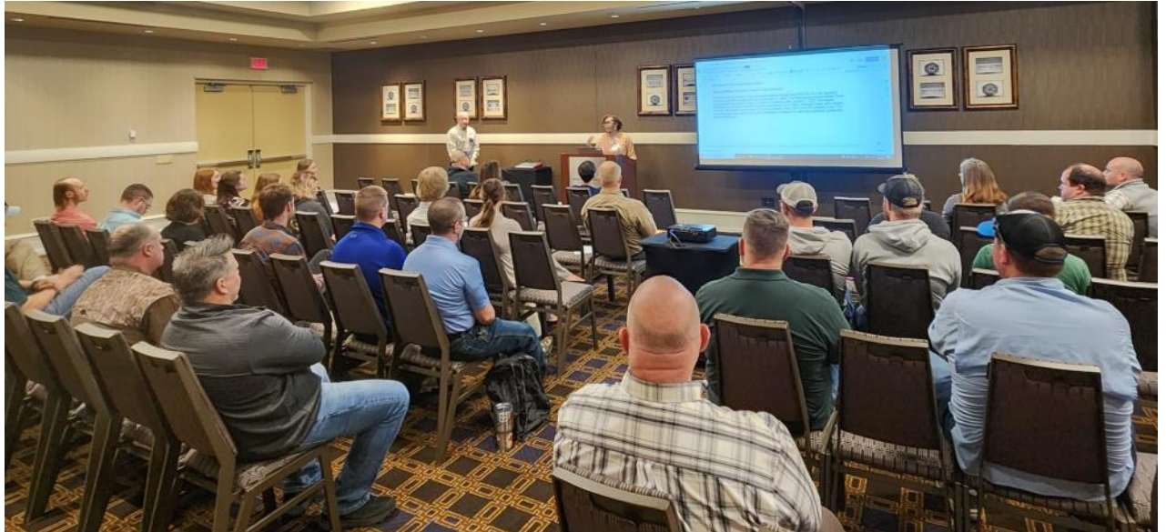
Pictured above: NCD AFS Leadership at the 2023 Midwest Fish and Wildlife Conference