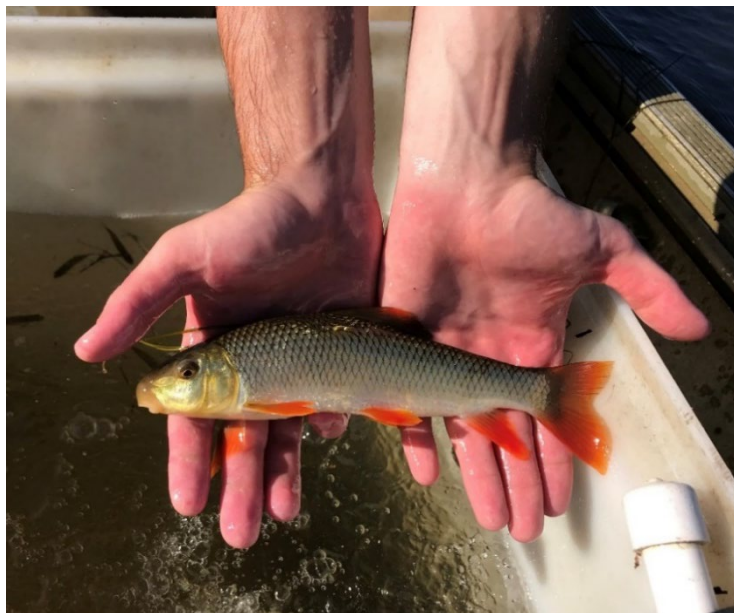
A juvenile greater redhorse from the St. Joseph River

During the summers of 2021 and 2022, we collected crayfish during electrofishing surveys. Similar to turtle sampling, crayfish were collected in an effort to determine species distributions in the St. Joseph River Watershed. Six species were collected over the 2 summers which include the Northern Clearwater Crayfish ( Faxonius propinquus ), Rusty Crayfish ( Faxonius Rusticus ), Virile Crayfish ( Faxonius virilis ), Calico Crayfish ( Faxonius immunis ), White River Crayfish ( Procambarus acutus ), and Big Water Crayfish ( Cambarus robustus ). In total, 587 crayfish were collected. Northern Clearwater Crayfish was the most commonly collected species (256 total) and represented almost 50% of the catch. Rusty Crayfish was the second most commonly collected (132 total), while Virile Crayfish was the third (117 total). Northern Clearwater Crayfish was the most common species in the smaller tributaries, while Rusty Crayfish appeared to dominate the larger rivers.