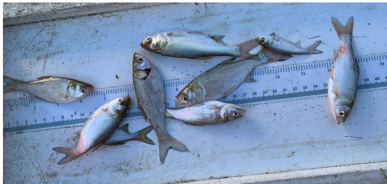
YOY Silver carp captured via surface trawl in Markland Pool of the Ohio River, August 2022.

August and September involved targeted invasive carp sampling to collect otoliths for age/growth analysis, along with one trip to the upper Wabash River to implant acoustic tags in carp. In October, we assisted USFWS and KDFWR with standardized fish community electrofishing on the Ohio River. Data collected will inform USFWS hydroacoustic research to help estimate invasive carp biomass in the river. Throughout the entire year we maintained a Vemco receiver array on the lower Ohio River, and a couple of days were spent conducting targeted invasive carp removals. The rest of the fall consisted of entering/analyzing data while sectioning and aging around 400 Silver Carp otoliths.