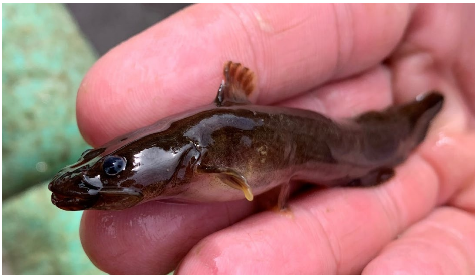
Pictured above: Freckled Madtom ( Noturus nocturnus ) or potentially unknown madtom to Indiana?