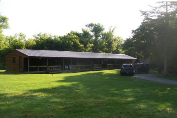
Accommodations at the Lakeside Laboratory

This summer's WTC meeting was held jointly with the Centrarchid and Esocid Technical Committees July 25-26 at Iowa Lakeside Laboratory on the shore of West Okoboji Lake in Milford Iowa. The first day consisted of a Yellow Perch Symposium with 9 presentations followed by a welcome social and BBQ hosted by the Iowa State AFS student sub-unit. Day two consisted of 17 assorted presentations and was followed by separate business meetings of the committees on the third day. In total, we had 43 people attend the Yellow Perch Symposium and 58 people, representing 14 different organizations, attend the general meeting. Kudos to the Iowa State student sub-unit for participating in the meeting and being able to use this opportunity as a fund raiser to help support their activities during the school year.