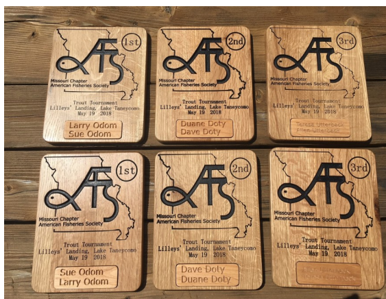
MOAFS Trout Tournament Award winners.