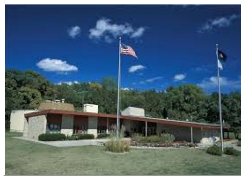
AkSarBen Aquarium, Near Gretna, Nebraska

See you July 2017 at the joint summer meeting in Kansas