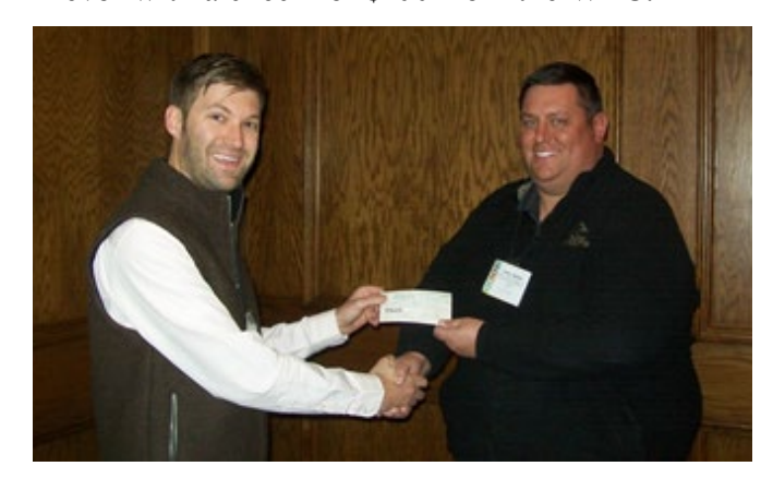
continued on next page.