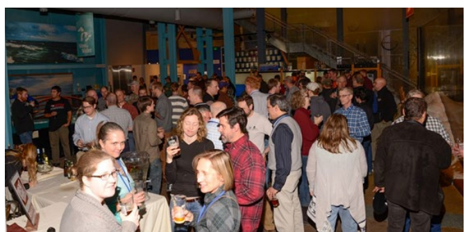
Forestry and fishery professionals network at the Great Lakes Aquarium during the welcome reception.