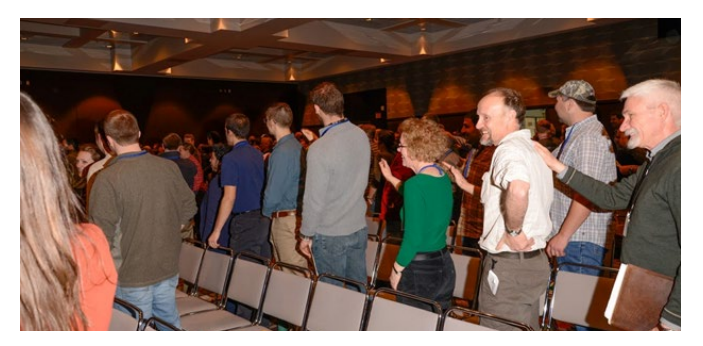
Forestry and Fishery professionals are encouraged to pat each other on the back during the plenary session.