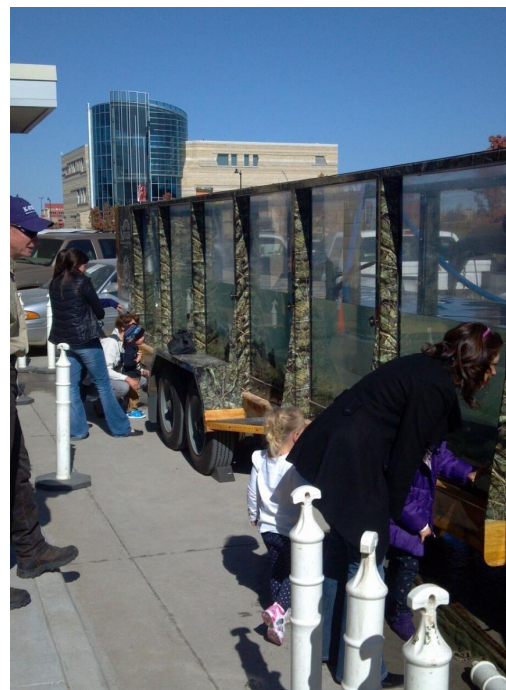
The KSU-AFS student subunit assists the Kansas Department of Wildlife, Parks and Tourism in educating the public and the government at the 2013 Governor's Water Conference in Manhattan, KS.