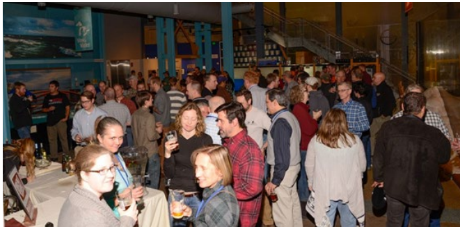
Forestry and fishery professionals network at the Great Lakes Aquarium during the welcome reception.