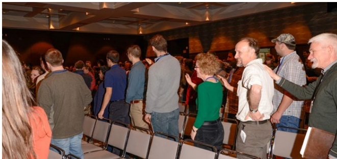
Forestry and Fishery professionals are encouraged to pat each other on the back during the plenary session.