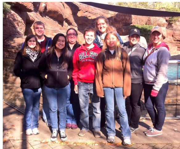
Ball State University AFS students at the Indianapolis Zoo